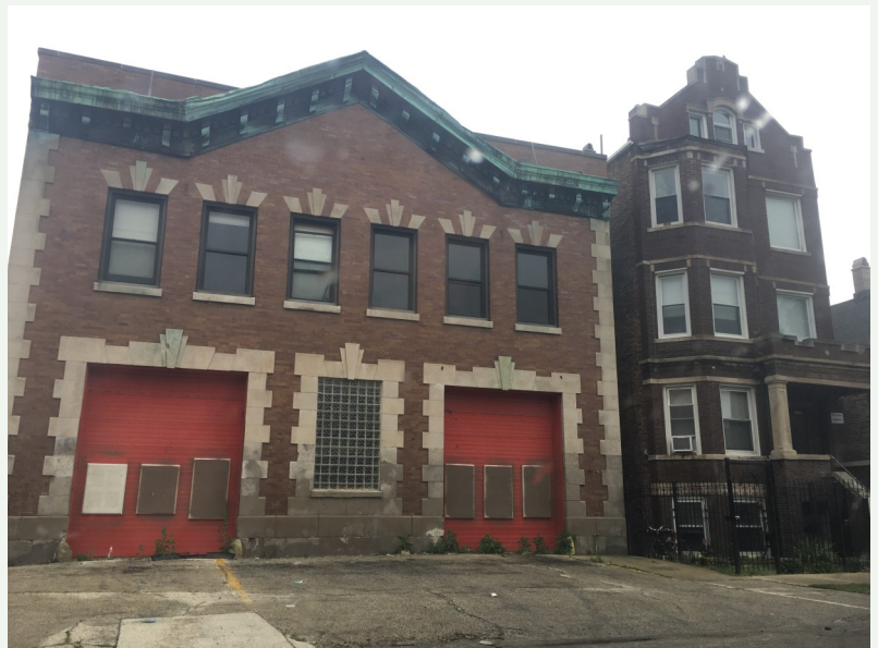
The vacant Chicago Fire Station, 2358 S. Whipple.

Please keep the LVEJO team and this blossoming community project in your prayers.