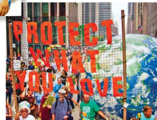
There is no PLANet B.