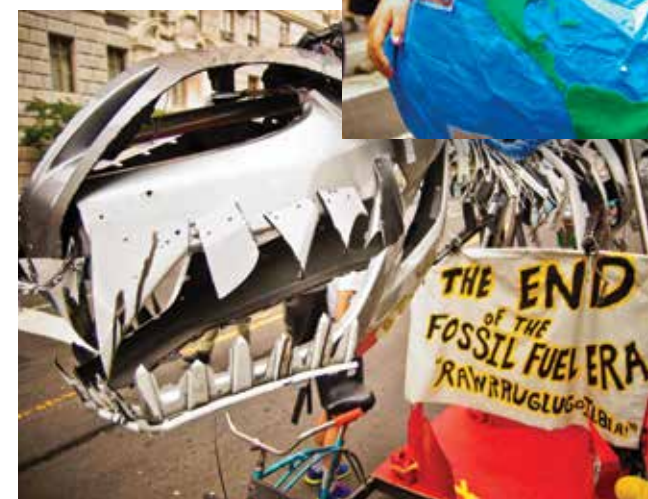
The End of the Fossil Fuel Era