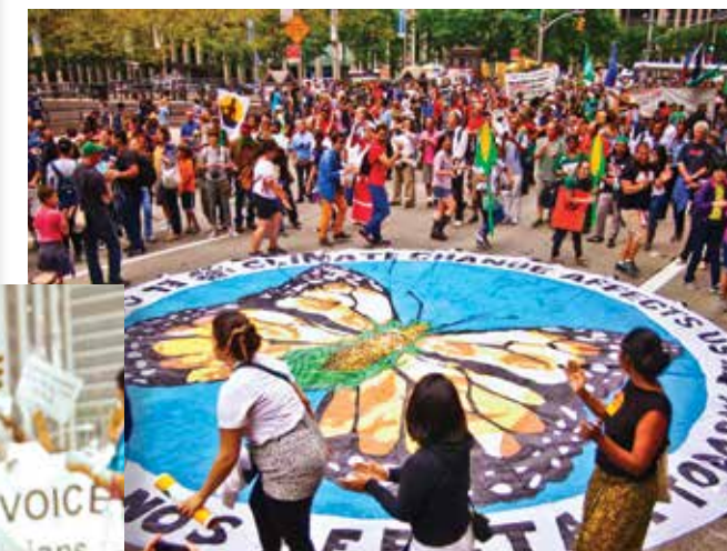
Volunteers worked collectively to design and create stunning banners.