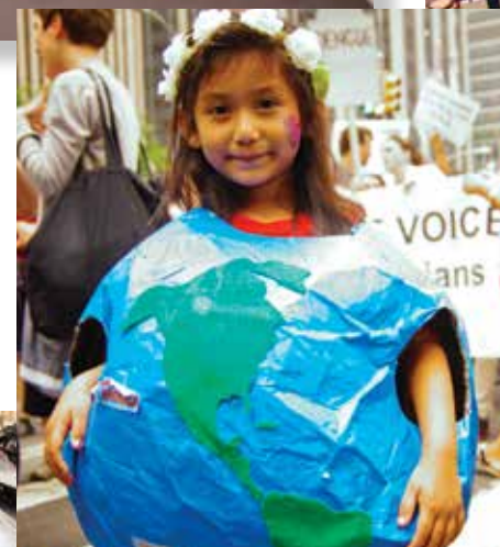
Child of Earth