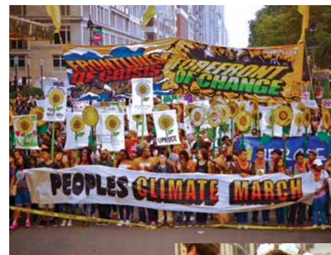
Frontlines of crisis, forefront of change: Indigenous groups, environmental justice, and other communities led the charge during The People's Climate March in NYC.

To date, the FSM have pledged nearly $10 million in investments that will promote compassionate care of creation—such as climate change mitigation—in collaboration with others.