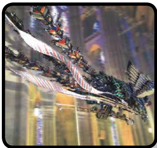
Phoenix in St. John the Divine Cathedral, New York City.

The Mission of the Franciscan Sisters of Mary is to be the presence of the loving, serving, compassionate, healing Jesus.