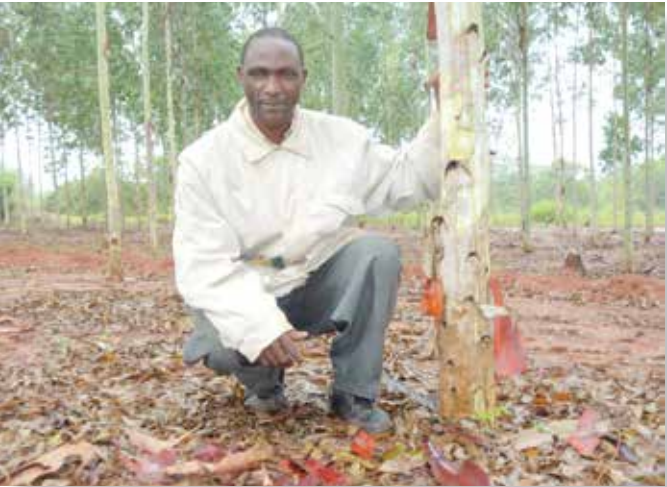
A tree farmer among his trees in Kilifi County, Kenya.

The FSM also invest in forest conservation to protect habitats for endangered species (some 58,344 acres in three locations), recycling of over-the-road tires and other waste conversion projects, and technologies that deliver value by using limited or zero nonrenewable resources and creating less waste than other approaches—e.g., renewable energy, water purification, and waste remediation—as well as bringing about gains in efficiency in manufacturing, lighting, power delivery, storage, and motors.